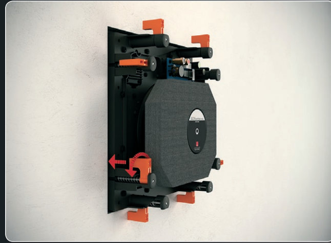
PHANTOM dogleg system

The new DALI PHANTOM models are the perfect choice if you are seeking true Hi-Fi quality that is discrete and easy to install in your home, office or in public environments.